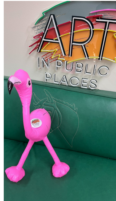
Submitted by Arts and Culture

If you'd like to be entered into the random prize drawings, visit the submission form to submit your best photos of Flavia helping out your team. Random prize drawing winners will be announced weekly up until Employee Appreciation Day in June. ( Full instructions can be found on the Employee Appreciation Day webpage.)