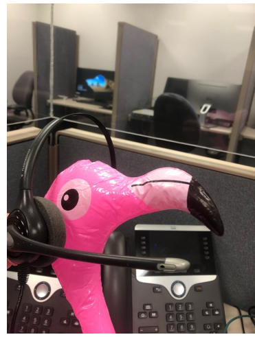
Submitted by the Clerk's Office

If you'd like to be entered into the random prize drawings, visit the submission form to submit your best photos of Flavia helping out your team. Random prize drawing winners will be announced weekly up until Employee Appreciation Day in June. ( Full instructions can be found on the Employee Appreciation Day webpage.)