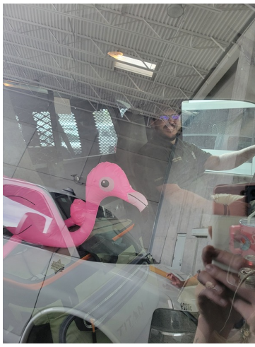
Submitted by the Sheriff's Office