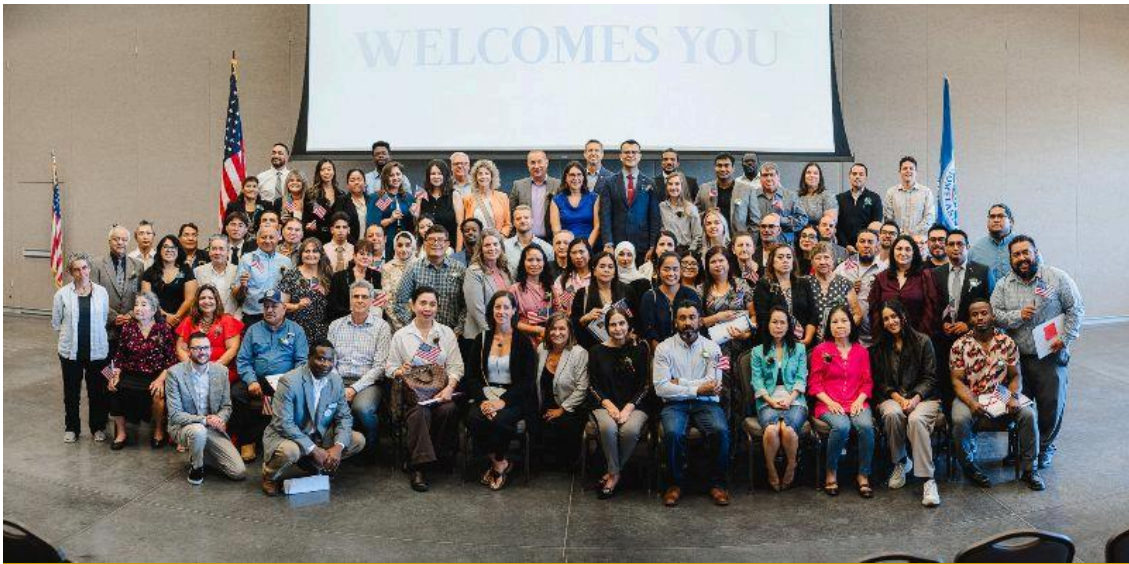
With 80 New U.S. Citizens and County Residents

children. I am especially excited for summer 2024 when we will provide free access to our recreational facilities for Salt Lake County children ages 5–18 and will eliminate library fees for children. I believe investing in our youth is investing in our future as a county.