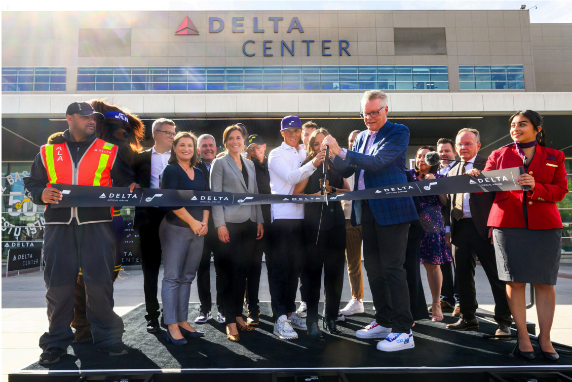
Delta Center Renaming

Thank you for your time, effort, and heart in making Salt Lake County an outstanding place to be. I look forward to everything we will accomplish together in 2024!