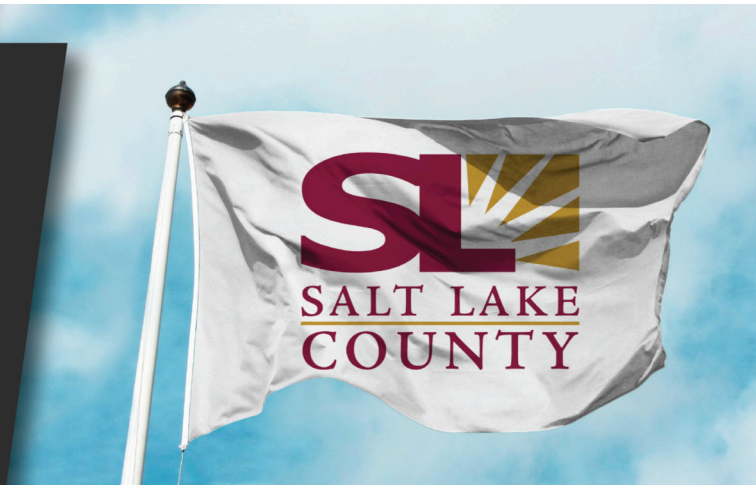
Jenny Wilson Mayor of Salt Lake County