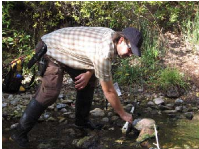
Staff collecting stream data for EHI/SFI

This appendix contains the protocol for the Ecosystem Health Index (EHI) and Stream Function Index (SFI). Additionally, this appendix includes contains a descriptions of the targets for the EHI and SFI.