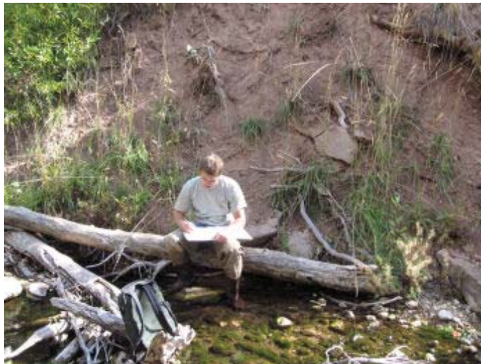
Staff collecting stream data for EHI/SFI