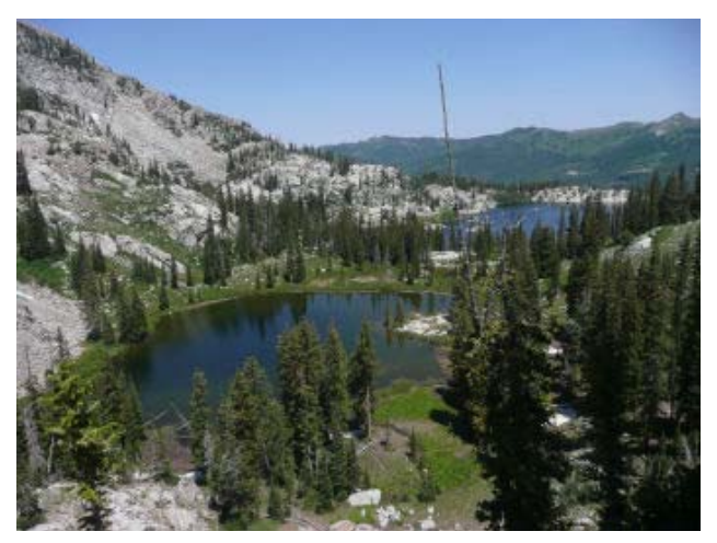
Lake Mary, Upper Big Cottonwood Creek Sub-Watershed

To determine if an amendment is necessary, the cursory review will examine compatibility of the proposed amendment with existing permits and TMDLs as outlined in the WaQSP. If the proposed amendment is consistent with the WaQSP, a permit request may be sent to the State DWQ to proceed through their permit application process. If the proposed amendment is not consistent with the existing WaQSP (i.e. is not identified in the current WaQSP document), an amendment to the WaQSP will be required. It is noted that the Area-wide Water Quality Planning Agency (APA) (Salt Lake County) has the prerogative to refuse an amendment