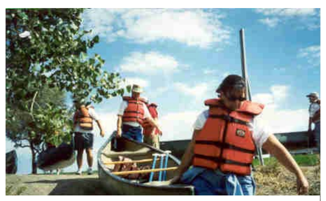
Canoe trip, Jordan River Corridor Sub-Watershed

In addition to the stakeholder groups and campaigns outlined above, Salt Lake County has organized and facilitated the Jordan River Watershed Council (JRWC), a stakeholder advisory group established to facilitate involvement in water quality and watershed issues. The JRWC was initially created in 1978 as a result of the Area-Wide Water Quality Management Plan. The JRWC contains representatives from federal, state, and local