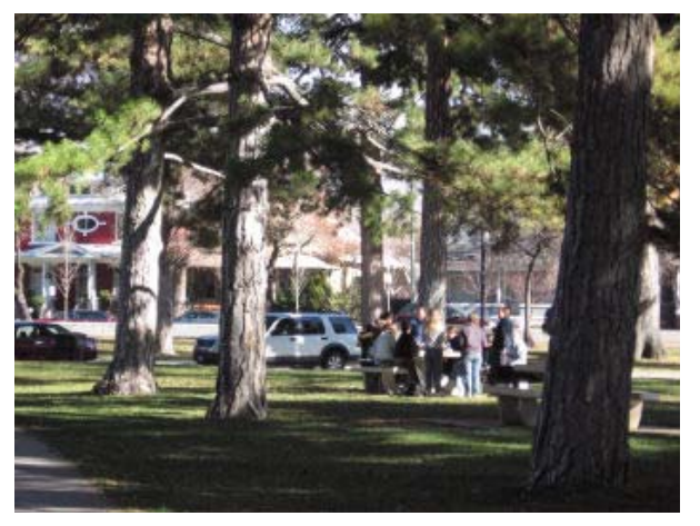
Picnic facility, Jordan River Corridor Sub-Watershed