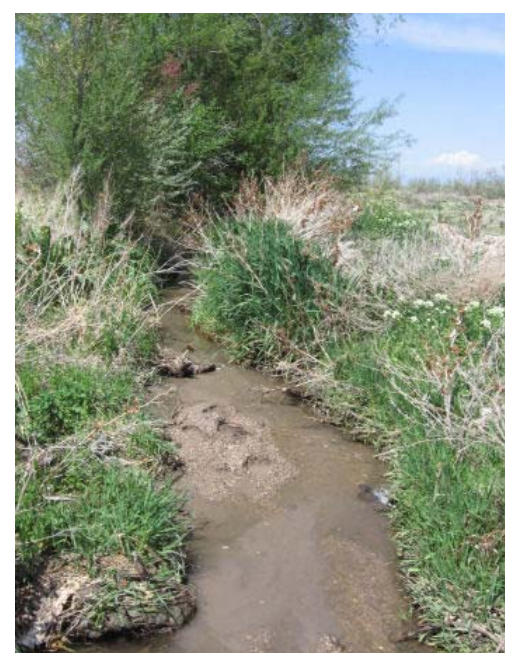
Lee Creek, Great Salt Lake Sub-Watershed

WQM planning responsibility, the legal authority for requiring compliance under the other laws is vested with other public and private entities. It is, therefore, important to first identify these "stakeholders" and second involve them in the planning process.