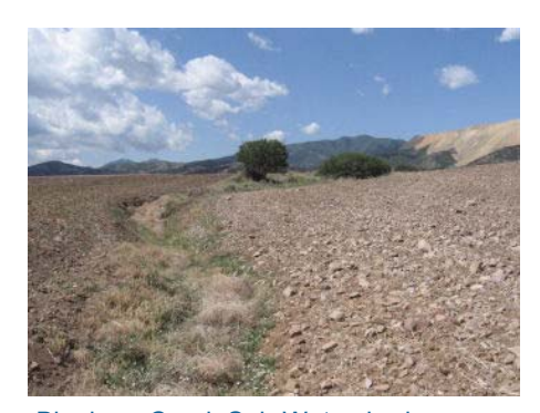
Bingham Creek Sub-Watershed