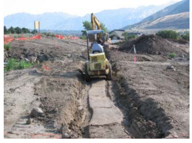
Excavation near Corner Creek, Lower Corner Creek Sub-Watershed

Stormwater Discharges Stormwater discharges are generated by precipitation and runoff from land, pavements and other surfaces. Stormwater runoff accumulates pollutants such as oil and grease, chemicals, nutrients and bacteria as it travels across land. Heavy precipitation or snow melt can also cause sewer overflows which in turn, may lead to contamination of water sources. Most stormwater discharges are considered point sources and are covered by the UPDES discharge permit system. A UPDES stormwater discharge permit (#UTS000001) has been issued by DEQ to Salt Lake County. The Public Works Department and the Salt Lake Valley Health Department entered into a Memorandum of Understanding to formalize a procedure for the enforcement of applicable statutes, ordinances and health regulations prohibiting the discharge of pollutants, contaminants or wastes into waterways and storm drainage systems.