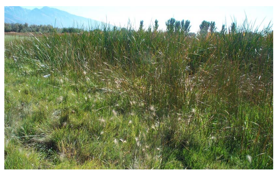
Wetlands along Jordan River, Jordan River Corridor Sub-Watershed