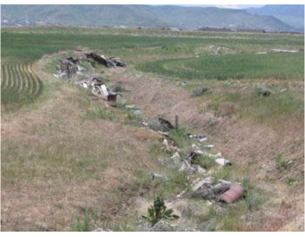
Trash in Copper Creek, Great Salt Lake Sub-Watershed

Dredge and Fill Section 404 of the CWA regulates the discharge of dredged or fill material into waters of the United States, including wetlands. Section 404 requires a permit from the U.S. Army Corps of Engineers before dredged or fill material may be discharged into waters of the United States. The Corp of Engineers administers the program, including individual and general permit decisions. In addition, the Corp conducts or verifies jurisdictional determinations; develops policy and guidance; and enforces the provisions of Section 404.