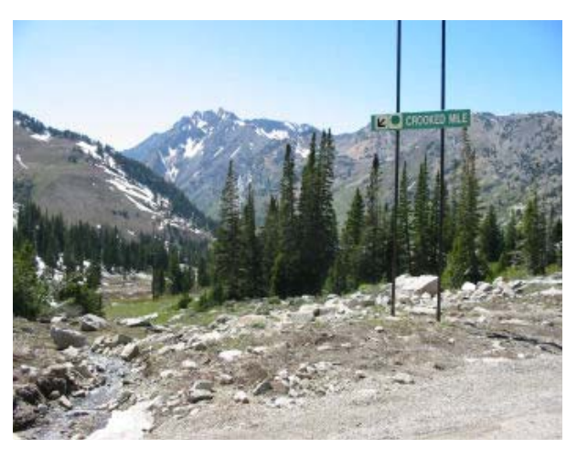
Albion Basin, Upper Little Cottonwood Creek Sub-Watershed

In identifying and reviewing proposed projects and/or management strategies, Salt Lake County, and its partners, will use the above criteria to direct decisions.