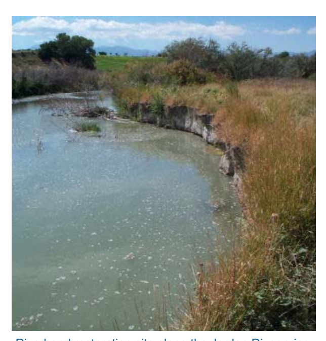
Riverbend restoration site along the Jordan River prior to construction (2000)

In order to effectively use existing resources to develop and implement sub-watershed plans, Salt Lake County will work with local stakeholders to identify priority sub-watersheds. It is anticipated that these priority sub-watersheds will be identified in 2008 and that plan development and implementation will begin in 2009.