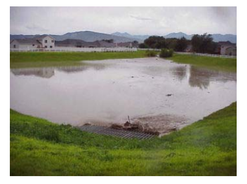
Detention pond on Midas Creek during flood event