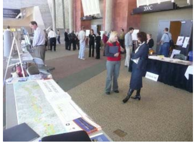
2007 Salt Lake Countywide Watershed Symposium