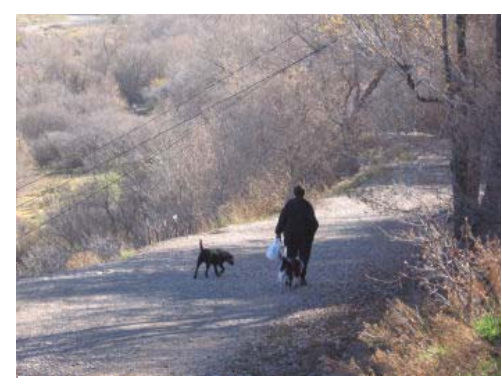
Dog walker in Lower Parley's Creek Sub-Watershed

In addition to the existing campaigns and stakeholder groups, there are likely a number of