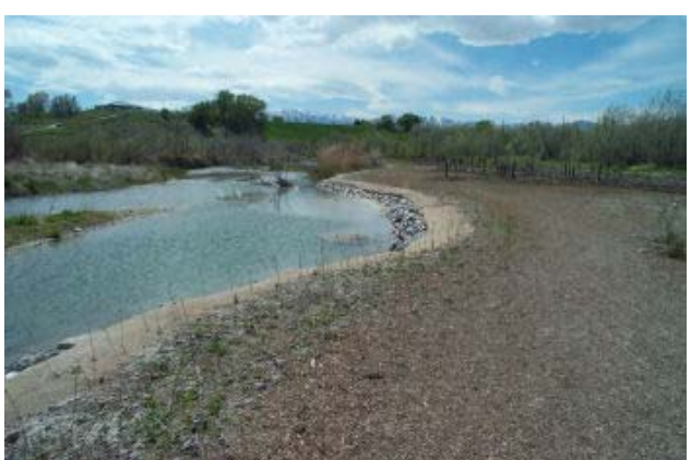
Riverbend restoration site along the Jordan River after construction (2002)