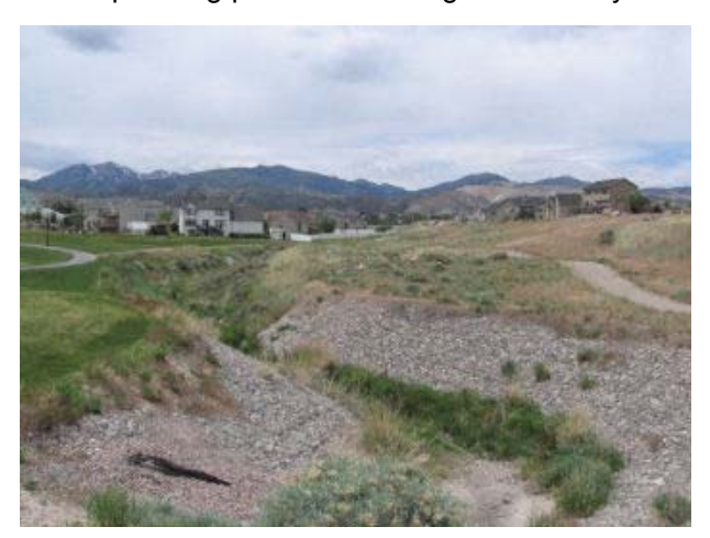
Rose Creek, Lower Rose Creek Sub-Watershed

Many of these laws regulating quantity and quality are relevant and appropriate to consider in the WQM planning process. Although the County has