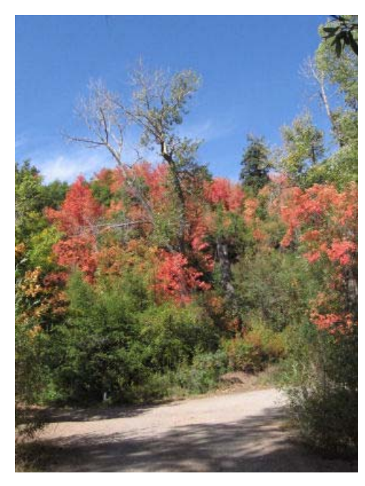
Riparian area in Upper Parley's Creek Sub-Watershed