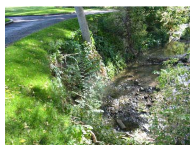
Parley's Creek, Lower Parley's Creek Sub-Watershed

In order to assure that water quality and environmental considerations are fully addressed in any proposed amendment process, Salt Lake County will review the amendment to confirm that it is in harmony with the strategic targets, recommendations, and policies outlined in the WaQSP. If an amendment request is found to counteract, or violate, any of the WaQSP targets, recommendations and/or policies, Salt Lake County may require that additional management practices or mitigation efforts be employed to address these concerns. Additionally, Salt Lake County may require that an Environmental Assessment be conducted as part of the amendment process.