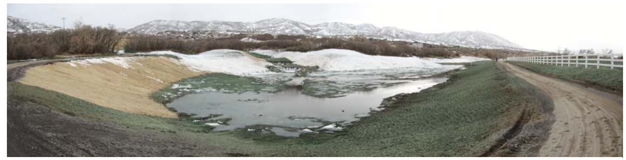
Corner Canyon Debris Basin, Lower Corner Canyon Sub-Watershed

The CWA required the development of regulations to meet the water quality goals established in the Act (CWA, 1972). The federal regulations establish the procedural requirements for the preparation of a state Water Quality Management Plan (40 CFR Part 131, 1998). A Water Quality Management (WQM) plan is a document identifying areas in the state with water quality problems and setting ambient water quality standards (UAC R317-2, 2007) and effluent limitations to be achieved in intrastate waters. The WQM plan is the basis for implementing sound water quality management decisions, implementing effective control programs and achieving water quality standards. One of the requirements of the WQM plan is the identification of regulatory programs and management agencies suitable to attain the water quality standards.