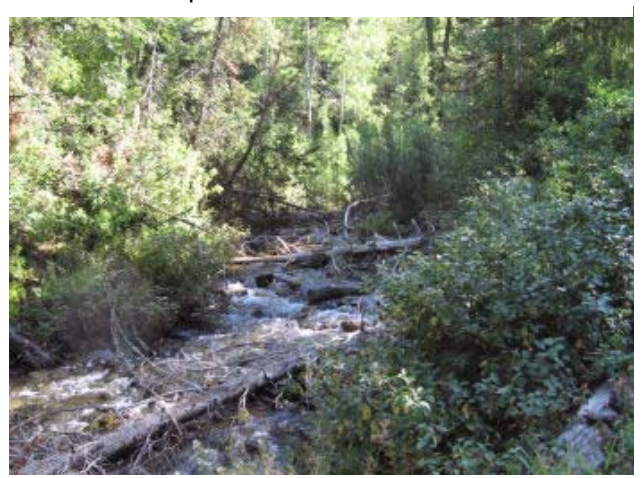
Mill Creek, Upper Mill Creek Sub-Watershed

Knowledge and Level of Concern Two thirds, or 68% of those surveyed felt that they were very familiar or somewhat familiar with water quality concerns in the streams and rivers in Salt Lake County. Of the six characteristics of a watershed, water quality was viewed as the most important by 51% of the respondents.