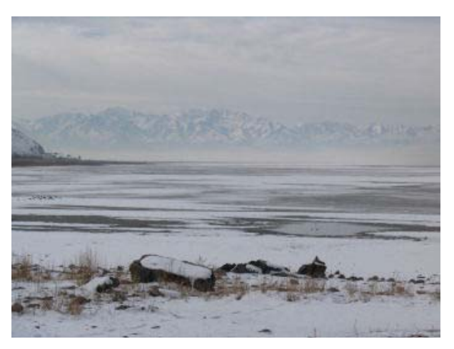
Great Salt Lake, Great Salt Lake Sub-Watershed

Facility Construction Permits The EPA has delegated the implementation and compliance requirements of the CWA to DEQ. A UPDES discharge permit from DEQ is required for new "point source" discharges such as wastewater treatment plants. Each wastewater treatment entity in Utah was required to have developed a Facilities Management and Financial Plan (FMFP) by 1985 (UAC R317, 2007). These plans are a