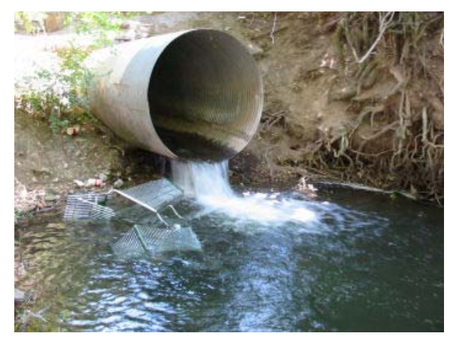
Discharge into Mill Creek, Lower Mill Creek Sub-Watershed

prerequisite to the issuance of construction permits for new or significantly modified wastewater treatment facilities and for the certification of new or renewed UPDES discharge permits (UAC R317, 2007). The FMFP must include: 1) an evaluation of alternatives in sufficient detail to determine the most cost effective and environmentally sound treatment strategy; 2) a financial plan to pay for all project costs; 3) optimizing the operation and maintenance of existing facilities; and 4) be consistent with "all applicable state and federal laws" regarding pollution control. Since FMFPs were not required prior to 1985, these planning elements have not been included in the County's Area-Wide WQM plan.