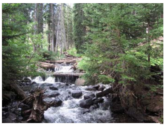
Big Cottonwood Creek, Upper Big Cottonwood Creek Sub-Watershed