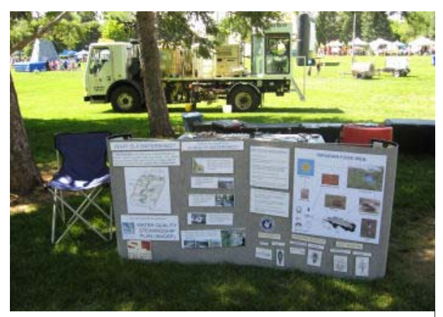
Information board at Mill Creek Outdoors Festival 2008

Tabling Events On an annual basis, Salt Lake County targets six (6) tabling events at various venues throughout the County. The purpose of these tabling events is to provide information to the public at large regarding water quality and watershed issues. Information is distributed at these events through printed materials and personal discussions with interested parties. These informational tables are provided at events such as Saturday markets, water fairs and other community events.