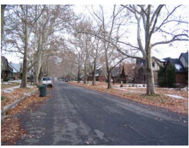
Salt Lake City residential area, Lower Parley's Creek Sub-Watershed

from 1980 to 2000. During the years following the plan update, numerous water quality improvement activities occurred as part of the on-going water quality planning efforts of Salt Lake County. However, in January 2005, the Utah Department of Environmental Quality (DEQ) recommended that the Area-Wide Water Quality Management Plan be amended to support the issuance of a new Utah Pollutant Discharge Elimination System (UPDES) discharge permit that would allow treated effluent from a proposed wastewater treatment facility in Riverton to discharge to the Jordan River. This requested amendment initiated a renewed interest in the planning process and instigated the development of this Water Quality Stewardship Plan (WaQSP).