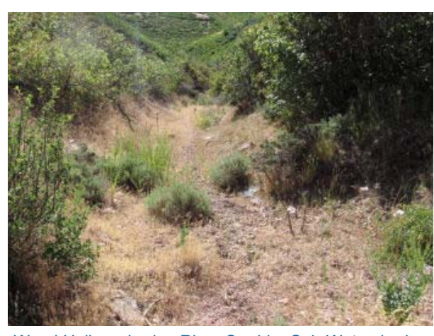
Wood Hollow, Jordan River Corridor Sub-Watershed

Survey respondents were somewhat neutral when asked if they felt Salt Lake County government is doing enough to protect our