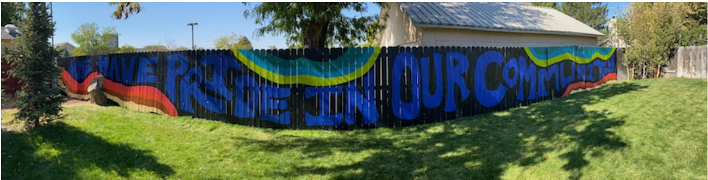
2020 Milestone house backyard fence “We Take Pride in Our Community” joint service project with the SLCo Youth Action Board

Built in 2020, each unit has 3 bedrooms, 2 bathrooms, a laundry room, and a spacious kitchen that will be used as the young adults practice their life skills during their time in the Milestone TLP. There is a common area outside the apartments to support the participants and provides a quiet and calm safe space.