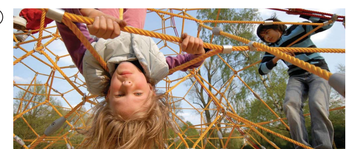
7 PICKLE BALL COURTS