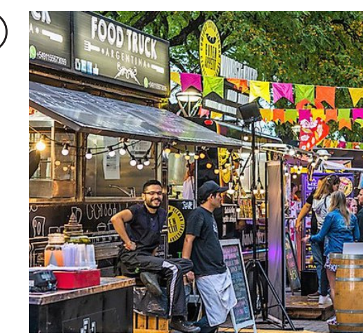
2 FOOD TRUCKS