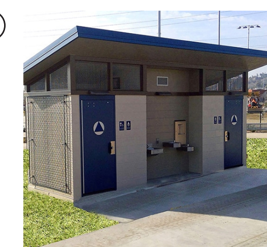
5 SYNTHETIC SPORTS FIELD