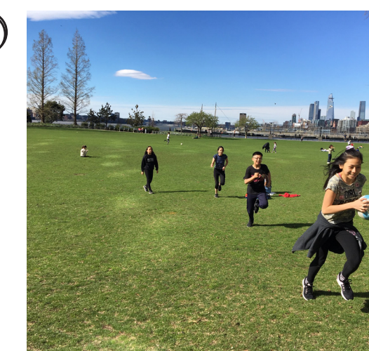
4 EXPANDED PARKING