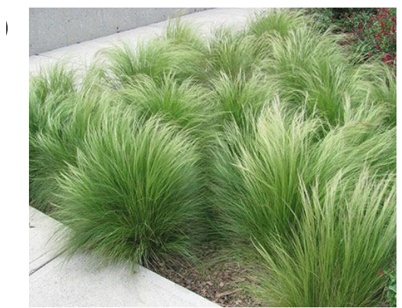
1 LOW-WATER PLANT BEDS