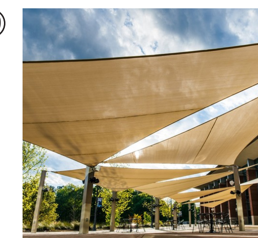
6 OPEN LAWN